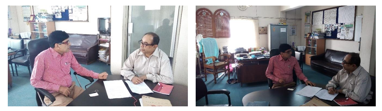
Figure 2.1: Consultation with chief water management, BWDB about water pricing of irrigation projects of BWDB

Besides, CEGIS made a consultation with Bangladesh Water Development Board (BWDB) about the water ricing of irrigation projects in Bangladesh as exhibited in the pictures below: