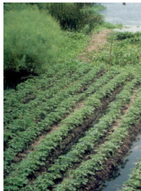
Floating gardens is being promoted as adaptation initiative. Floating garden is traditional to Southwest region

At the household level, the project expects to improve the capacity of 6,000 vulnerable households to adapt to climate change impacts by making them aware of new livelihood strategies using a group-based approach. Staff belonging to a number of local partner organizations including NGOs, community-based organizations and research organizations will provide training and support to these households to practice adaptive initiatives such as floating gardens (baira) and growing saline and water tolerant varieties of crops.