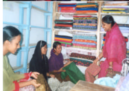
To ensure women participation in trade/Commerce, RDP-16 established Women Marketing Section