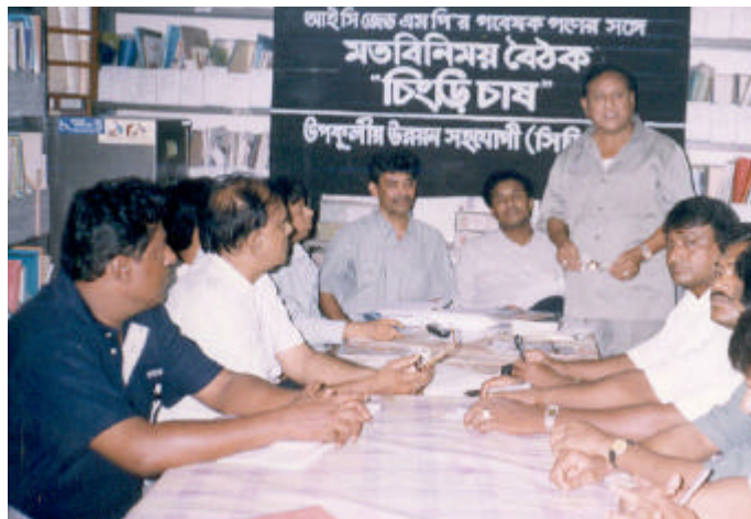
Focus Group discussion at the CDP information center in Khulna with different stakeholders

The Coastal Zone has its unique features of opportunities and vulnerabilities. On one hand the sectoral management legacy is inherent as a part of the national one, on the other hand coastal zone as interface and recipient of the both marine and terrestrial natural systems and overlapping ecosystems require holistic management approach to support the coastal development and coastal livelihood. The complexities of the natural systems call for harmonization of the management over different resources. There are several sectors and issues that require attention to formulate coastal policy and strategy.