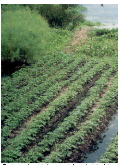
Floating gardens is being promoted as adaptation initiatative. Floating garden is traditional to Southwest region

At the household level, the project expects to improve the capacity of 6,000 vulnerable households to adapt to climate change impacts by making them aware of new livelihood strategies using a group-based approach. Staff belonging to a number of local partner organizations including NGOs, community-based organizations and research organizations will provide training and support to these households to practice adaptive initiatives such as floating gardens (baira) and growing saline and water tolerant varieties of crops.