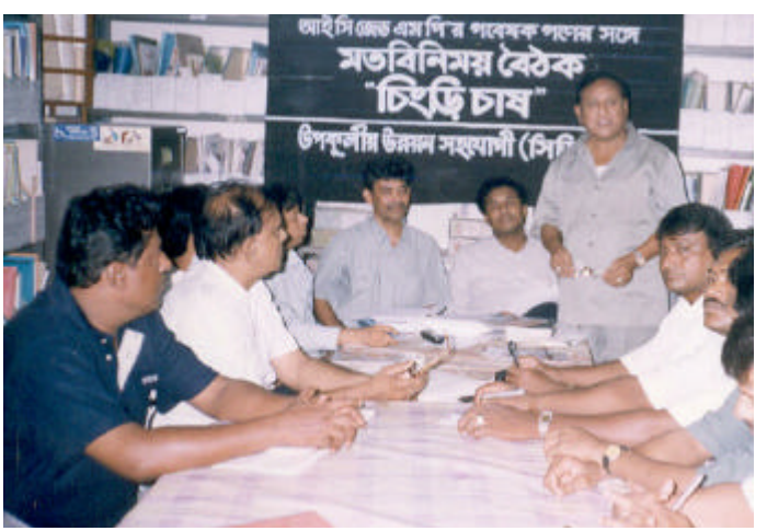
Focus Group discussion at the CDP information center in Khulna with different stakeholders

The shrimp case study is a try-out for an issue-oriented approach for the analysis of policy and legal instruments and institutional arrangements and has been carried out as a review based on secondary information and earlier studies. Data, information, reports have been collected, reviewed and analyzed in addition to interviews and focus group discussions at field and central levels. Shrimp sub sector activities analysis recorded the degree and magnitude of livelihood dependency on the sector.