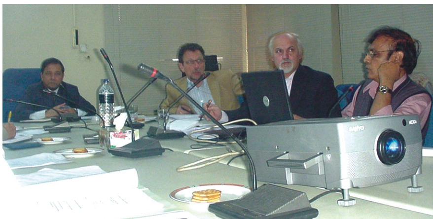
Twinning Mission members and WARPO officials are seen in the discussion.

Twinning Mission-XVI visited WARPO on 20th February 2007. They met with Director General, and discussed about ODP process and WARPO strategy. Director (Technical) and Task Force Coordinator assisted DG in the discussion. After the meeting with DG, the TM-XVI hold two discussion sessions with WARPO Task Force. Progress on Development Phase of ODP, Follow up Activities of TM-XV, Monitoring NWMP Implementation, updating of NWMP and Module of management training programme of WARPO were the main issues in the discussion.