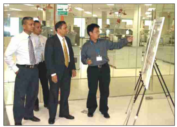
DG, WARPO visits the state of the art laboratory in Singapore action to tackle those issues.

Director General, WARPO attended the Experts Consultation Meeting on the Draft Asian Water and Development Outlook (AWDO) held in Singapore on 23 August 2007.