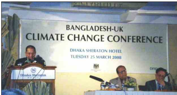
Dr Iftekhar Ahmed Chowdhury, Honourable Foreign Affairs Adviser, delivering his opening speech in the Conference

The UK, in collaboration with the Government of Bangladesh, hosted a major climate change conference at the Sheraton Hotel in Dhaka on 25 March 2008. The day long conference, arranged jointly by the British High Commission and DFID-Bangladesh. Honorable Advisers, top level representatives from different government ministries, climate change experts, the media and heads of donor organizations. were present in the conference It served as a stepping