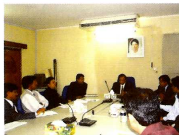
Participants from LGED, PDO-ICZMP, WARPO, BWDB, DoF, BRDB and CEGIS

The Coastal Zone Policy (CZPo) 2005 provides guidelines and the framework for the implementation of Integrated Coastal Zone Management (ICZM) programs. It gives direction for management practices for the coastal zone. The Coastal Development Strategy (CDS) focuses on the implementation of the CZPo. The Priority Investment Program (PIP) is the operational arm of the Coastal Development Strategy (CDS). The preparation of PIP is one of the major outputs of the project. It is based on the inventory of the projects, the development of criteria to select projects and programs for prioritization and possible implementation in the coastal zone.