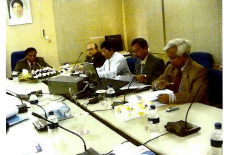
Mr. Hafiz Uddin Ahmad, B.B., Hon'ble Minister, MoWR and other Members of the Parichalana

Recalling the extended role of "Clearing house" & facilitating activities through "Program Coordination Unit (PCU)" of WARPO, it was mentioned that WARPO intends to implement these roles on priority basis among others within the framework of proposed ODP.